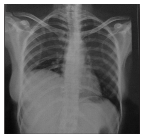
Figure 1: Chest radiograph postero-anterior view suggestive of right sided elevated diaphragm

The plain chest radiograph is very helpful in diagnosis of pulmonary hydatid cyst. Non-complicated hydatid cyst is usually asymptomatic and are identified on routine chest radiograph incidentally. Unruptured pulmonary hydatid cyst shows one or more homogenous round or oval masses with smooth borders surrounded by normal lung tissue on chest radiograph.<sup>[3]</sup> Water lily sign and crescent sign are pathognomic for ruptured hydatid cyst. Ruptured hydatid can also produce cumbo's sign, serpent sign and monod's sign.<sup>[1]</sup>