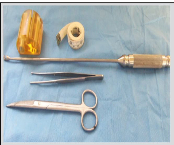
Figure 1: Equipment Used to Harvest and Measure the Dimensions of the ST Tendons

Forty formalin fixed cadavers without gross damage to the lower limbs or scars to the posterior thigh and medial knee regions were included in the study. An incision was made along the whole length of the posterior thigh towards the medial knee. Blunt dissection was used to expose the ST muscle and tendon. The ST tendon was harvested by use of a tendon stripper and its length obtained by tape measurement. Each tendon was then folded into a four strand construct of equal strand length and the thickness of the four strand construct obtained by use of sizing tunnels (Figure 1 and 2). Data were recorded and descriptive statistics obtained.