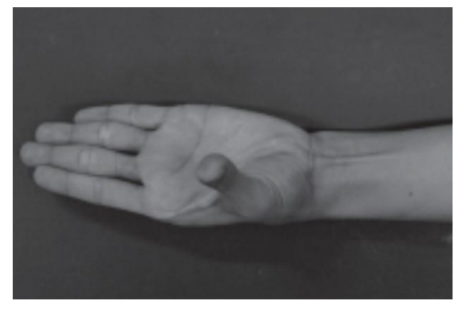
Figure 6 Mishra's 2nd Test