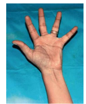
Figure 9 Open Hand Sign (Bhatacharya)