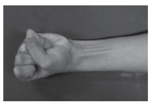
Figure 3 Thompson's Test

digits(7) (Figure 7). The Lotus sign is done by bringing the fingers and thumb together to form a cone (Figure 8) while in the open hand method, the patient is asked to fan out all the fingers and slightly flex the wrist (Figure 9). The Bhattacharya test is done wrist flexion against resistance(8)(Figure 10).