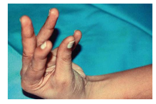
Figure 8 Lotus Sign (Bhatacharya)