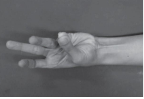
Figure1 Scheaffer's Standard Test