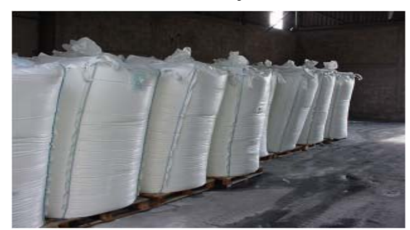
Figure 4. One tonne SuperGrainbags-HC<sup>™</sup> storing paddy with woven inside protective polypropylene bag.