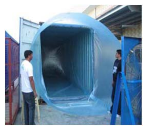
Figure 5. TranSafeliner<sup>™</sup> being installed in a standard shipping container, 2008.

moisture contents generate modified atmospheres due to the respiration of the microflora and the commodity itself. Data were compiled for insect control and for quality preservation of stored cocoa beans by employing a novel approach through the use of bio-generated modified atmospheres as a methyl bromide alternative. The respiration rates of fermented cocoa beans at equilibrium relative humidities of 73% at 26°C in hermetically sealed containers depleted the oxygen concentration to <0.3% and increased the carbon dioxide concentration to 23% within 5.5 days. This hermetically sealed flexible structure contained 6.7 tonnes of cocoa beans at moisture content of 7.3%. It was monitored for oxygen concentration and quality parameters of the beans (Fig. 6). No insects survived the oxygen