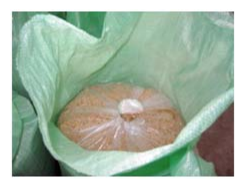
Figure 3. Hermetically sealed SuperGrainbag<sup>™</sup> with corn seeds inside a woven polypropylene bag.