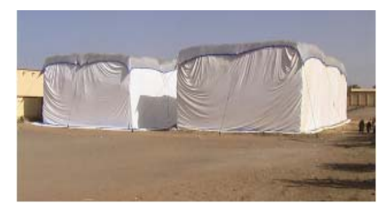
Figure 2. 1050 Tonne MegaCocoon™, Sudan, 2009.