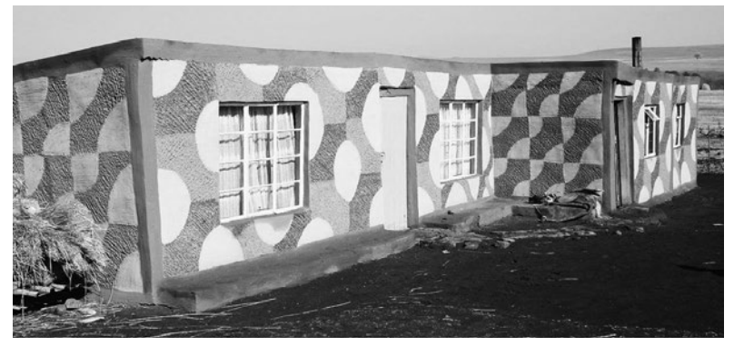
Figure 3: An adobe house in Tsiame near Harrismith

smaller (subset) sample in each of the areas, equally distributing the larger and smaller samples across the two Survey waves.