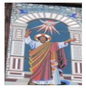
Plate 5: Stain-glass. Rufus Ajidahun