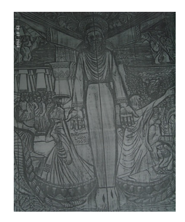
Plate 4: 14 Stations of the Cross. Bruce Onabrakpeya