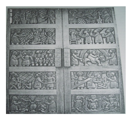
Plate 7: Carved door panels, Lamidi Fakeye