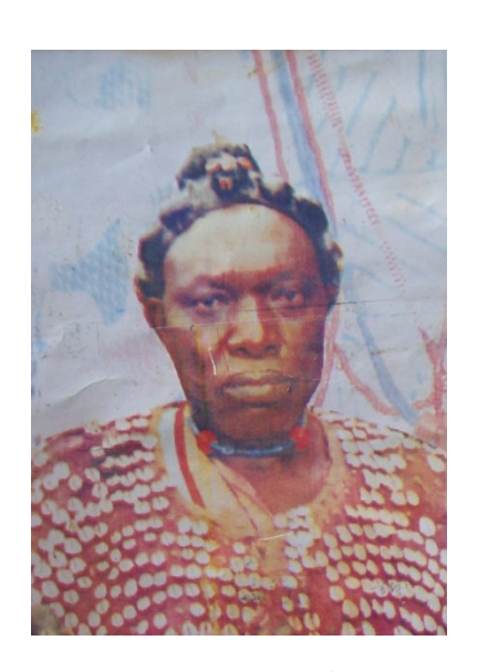
Plate 2: Devotee of Sango

Art as a Catalyst of Religious Development in Nigeria