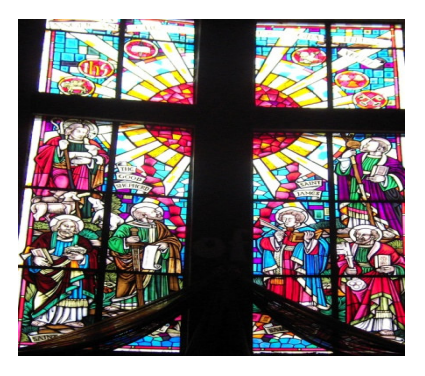
Plate 6: Stain-glass. Rufus Ajidahun