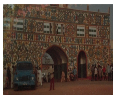
Plate 9:Calligraphic Design With