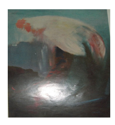
Plate 3: Peace (Ekpuk)