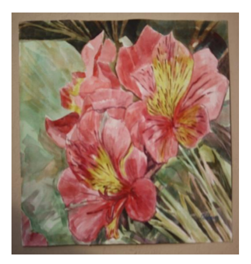
Fig. 15: BUNCH OF FLOWERS Man