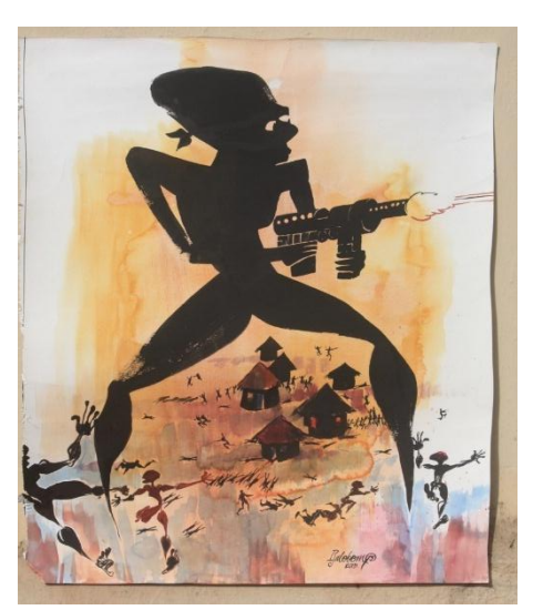
Fig. 13: The Silohoutte with AK 47