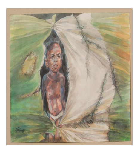
Fig 7: To Hand onto Our Children a Banner Without