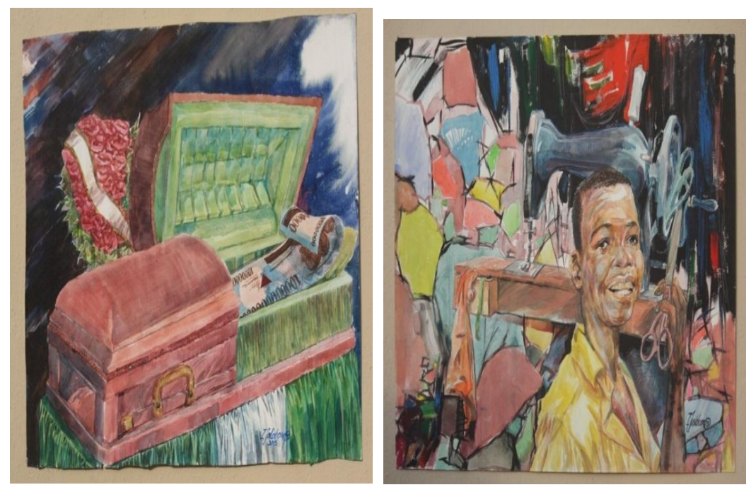
Fig. 1: The Coffin of State / The Requiem

All images in this Essay were taken from the exhibition catalogue PHCN , Please Help Clean Nigeria , Red Door Gallery, Victoria Island Lagos, 2015.