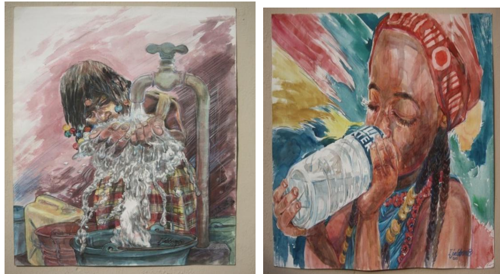
Fig 5: Drinking Straight from the Tap