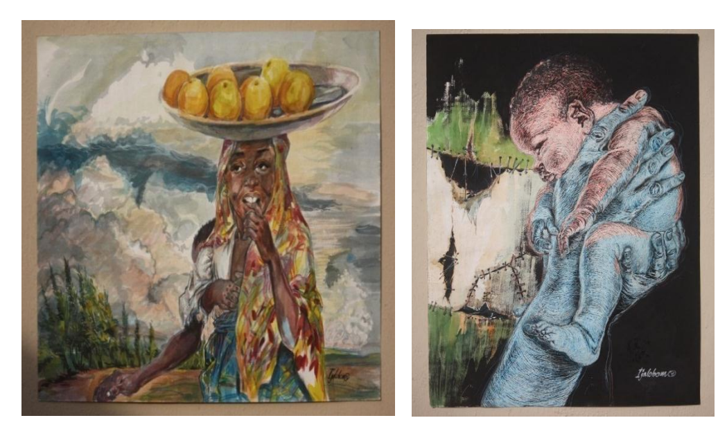
Fig. 3: Orange Seller