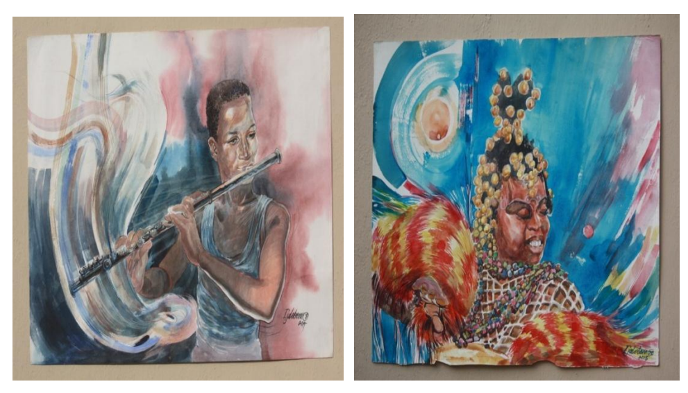
Fig. 11: The Flute Player