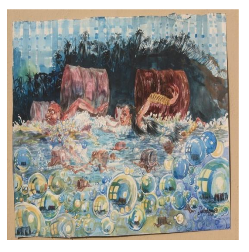
Fig. 8: Loot Loot Petroleum Corporation