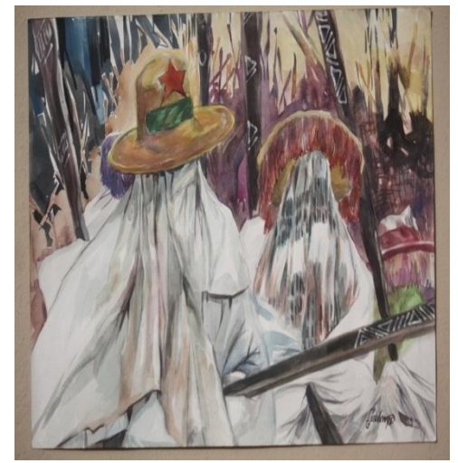
Fig 10: Eyo Dancers