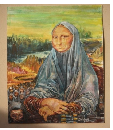
Fig. 14: O' Sambisa