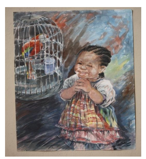
Fig. 9: Girl by The Parrot Cage