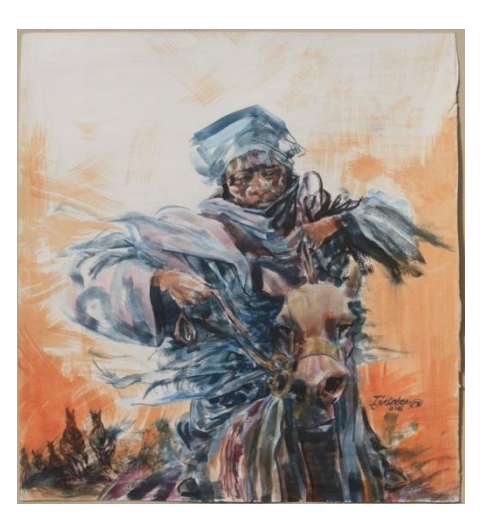
Fig 16: Eleshin, The Horse

Copyright © IAARR, 2007-2016: www.afrrevjo.net Indexed African Journals Online: www.ajol.info