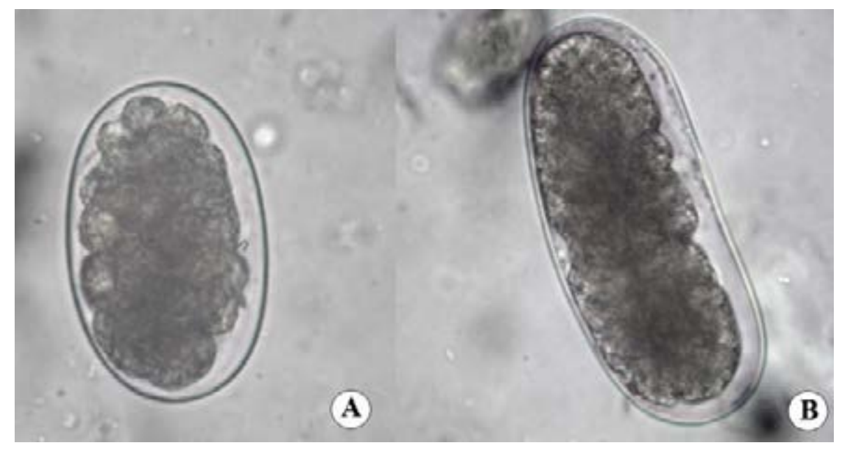
Figure 2. Hookworm egg (Diphasic concentration technique x 400) (A); Hookworm-like egg (Diphasic concentration technique x 400) (B).

In the remaining 157samples (98.7%; IC95%: 95.5-99.8), hookworm-like eggs with a slightly concave side and with range of size of 85.0 to 92.5 \,\mu\text{m} \ge 35.0 to 40.0