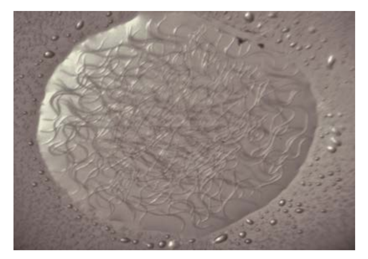
Figure 4. Larvae of C. elegans in water drop from the coprocultive (vision through electronic loupe).