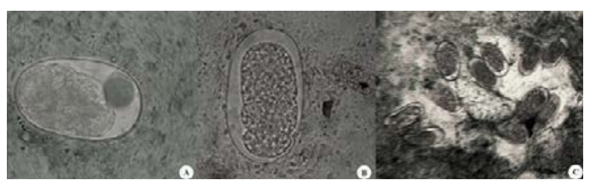
Figure 1. Hookworm egg in Kato-Katz technique (x400) (A); Hookworm-like egg in Kato-Katz slide (x400) (B), Hookworm-like eggs in Kato-Katz slide (x100) (C).

In the 497 faecal samples analyzed by Kato-Katz, in 159 samples (32%; IC95%: 0.2-0.3) we found the presence of eggs that were similar to those of hookworm (Figure 1A), named as hookworm-like eggs (Figure 1B and 1C). A total of 82 (51.1%; IC95%: 43.5-59.5) were from males and 77 (48.4%; IC95%: 40.4-56.4) were from females, mostly belonging to children who aged 9 years old (16.4%; IC95%: 10.9-23.0).