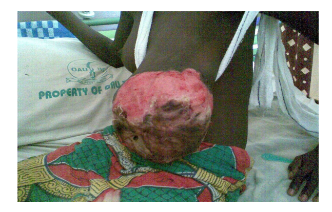
Figure 1: Picture showing huge giant fibroadenoma of the breast reaching below the umbilical level to the pelvis of the patient with destruction of nipple areolar complex

Physical examination essentially revealed an exhausted, pale, weak and tachycardic (pulse rate of 100 per minute, small volume but regular) young girl. She was not in painful distress. The left breast was hugely enlarged. Clinical measurement of the enlarged breast was about 30cm by 20cm (radius 10cm) (figure 1). This gives approximate breast volume of 3,000 mls where as the average breast volume in women in a study by katariya et al. using mammography measurements of length, radius and calculating with formula 1/3nr^2l (r = radius, l = length on mammogram) which correlate well with clinical measurement is 690 mls - 790 mls<sup>12</sup>. The breast was enlarged and also reaching to the level of the pelvis of the patient. The left breast mass was firm in consistency, not tender, not attached to the underlying pectoralis major muscle. There was ulceration of the skin at the central part of the breast involving and destroying the nipple areolar complex (figure 1). There was associated purulent discharge, slough and necrotic tissue over the ulcer with occasional contact bleeding. The right breast was normal with no palpable mass. The lymph node of the axilla and the supraclavicular region were not palpably enlarged.