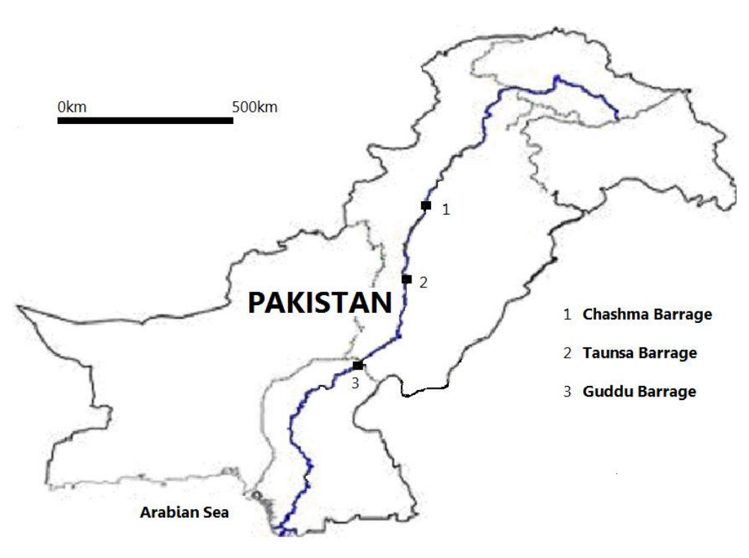
Figure 1. The map showing the three study sites.