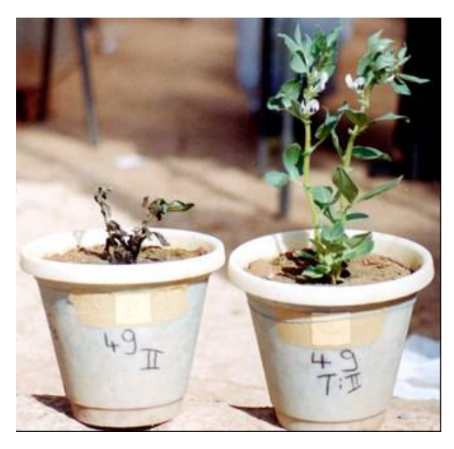
Figure 2. Comparison of a non-infested plant (on the right) with a plant infested with Aphis craccivora (on the left), for landrace V49.

The multiplication rate and the intrinsic rate of natural increase are synthetic values designed to reflect the po-