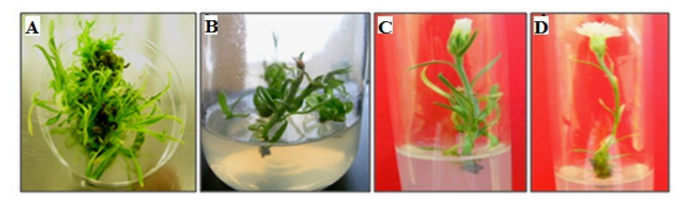
Figure 1. (A) In vitro flowering of C. Cyanus, (B) shoot separation and flower bud induction, (C) and (D) blooming at maturation.

medium supplemented with 1.0 and 2.0 mg/L 2, 4-D to initiate and maintain cell culture. Effects of 1.0 and 2.0 mg/L 2, 4-D on the growth kinetics of the cell culture were studied and growth parameters like packed cell volume (PCV), fresh weight (FW) and dry weight (DW) through the lag phase, log phase and stationary phase were recorded.