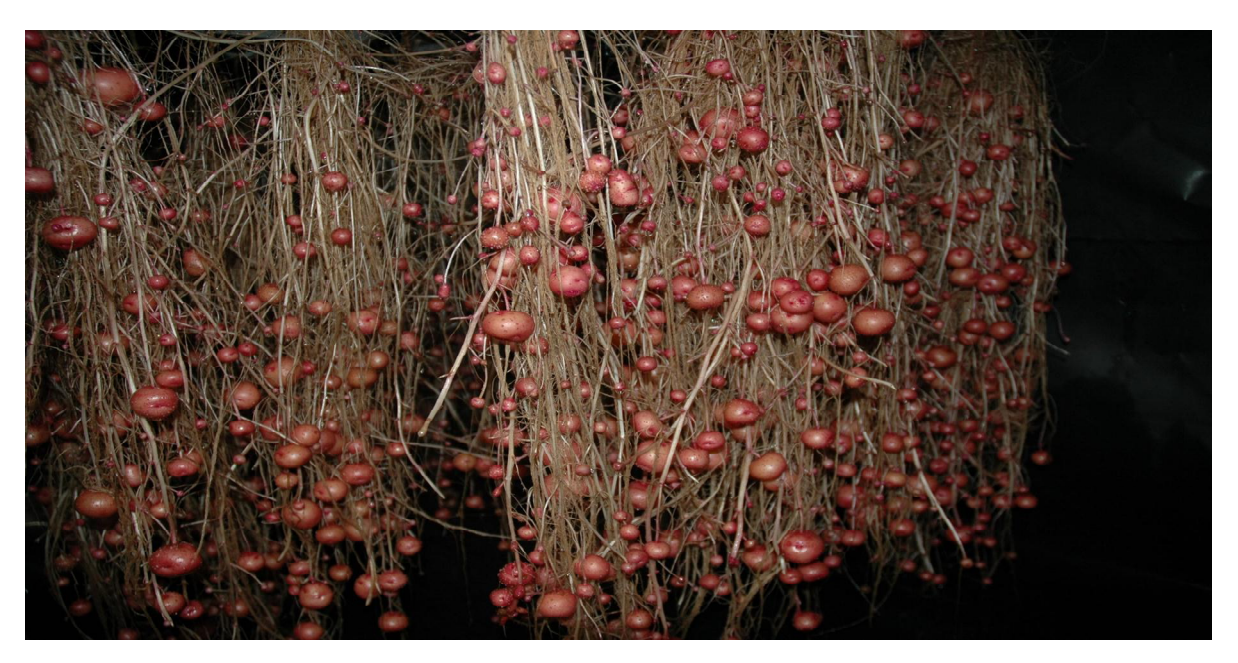
Figure 2. A picture of seed potatoes showing a prolific potato seed propagation and root air optimization in an aeroponic system (CIP, 2008).

efficient and cheaper system to rapidly produce high quality seed tubers for commercial production.