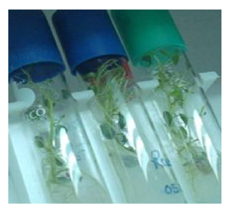
Figure 1. A picture of potato plantlets in a solid growth media in a tissue culture growth chamber (Chiipanthenga 2009, unpublished).

Tissue culture is not limited by the time of the year or weather. Healthy plants can be grown in a laboratory at any time of the year. In addition, conditions in the laboratory are ideal and therefore, conducive to all year round production scheduling. It also saves an enormous amount of daily care required by conventional cuttings and seedlings (Tudge, 1988; Mahmond, 2006). Tissue culture is also used in somatic hybridisation, the induction and selection of mutants and biosynthesis of secondary products (Beukema and Van der Zaag, 1990).