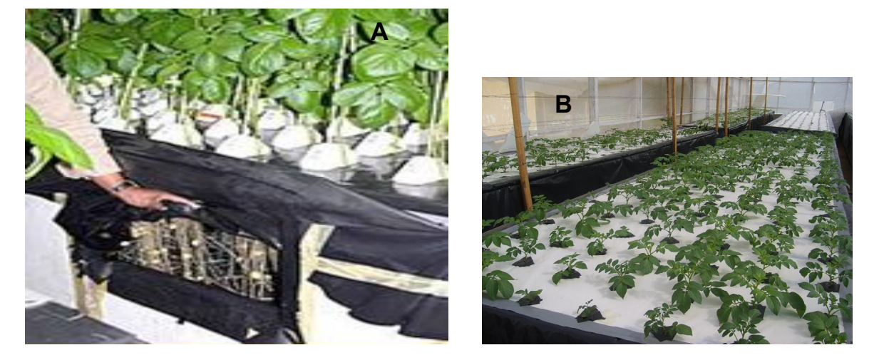
Figure 3. Aeroponic boxes lined with plastic in Rosario Falcon, International Potato Center (February 2009) (A) and at Universal Industries Ltd, Njuli-Estate in Malawi, 2009 (B).

thereby, reducing fertilizer requirement and minimizing risk of excessive fertilizer residues moving into the subterranean water table (Nichols, 2005). Aeroponics system also allows the measurement of nutrient uptake over time under varying conditions. Barak et al. (1996) used an aeroponic system for non-destructive measurement of water and ion uptake rates for cranberries. All these results clearly show that, aeroponics is a research tool for nutrient uptake and opens up possibilities for the monitoring of plant health and optimization of crops grown in closed environment. Aeroponics production system is very space efficient, with plants taking up minimal room. In contrast with other techniques such as hydroponics and conventional system, aeroponics exploits better vertical space for root and tuber development (Stoner, 1983). The environment under aeroponics is kept free from pests and diseases since plantto-plant contact is reduced hence; plants grow healthier and quicker than plants grown in a medium. In addition, if a plant becomes diseased, it is quickly removed from the plant support structure without disrupting or infecting the other plants (Figure 3). As a result, many plants can grow at higher density (plants per unit area) than in the traditional forms of cultivation such as hydroponic and soil (Stoner, 1983).