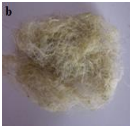
Figure 1. Fibers aspect. A. Before combing. B. After combing.