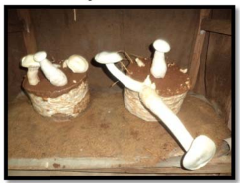
Figure 1. Cultivation technology of Calocybe indica.