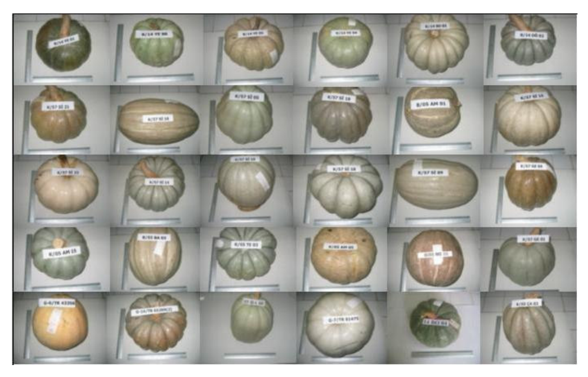
Figure 1. Picture of the diversity fruit size, shape and color for Cucurbita maxima populations which were collected from Black Sea Region in Turkey.

population of winter squash and exchanged seeds with surrounding areas, mainly at local markets. It is a traditional vegetable often grown in small gardens. However, for decades, the old winter squash landraces have progressively been replaced by new cultivars, including Arican 97, which ensure higher yields and incomes and meet the requirements of processors and consumers (Sari et al., 2008; Balkaya et al., 2009). However, the traditional landraces are the important genetic resources for plant breeders because of their considerable genotypic variations. These variations are maintained by deliberate selection for specific traits by farmers. At the research level, the diversity of genetic resources in collections may increase the efficiency of efforts to improve a species (Geleta et al., 2005). Determination of the degree of variation of quantitative and qualitative traits present in genetic resources is important for vegetable breeding programs (Escribano et al., 1998). Plant breeders can use genetic similarity information to complement phenoltypic information in the development of breeding populations (Greene et al., 2004; Balkaya et al., 2009).