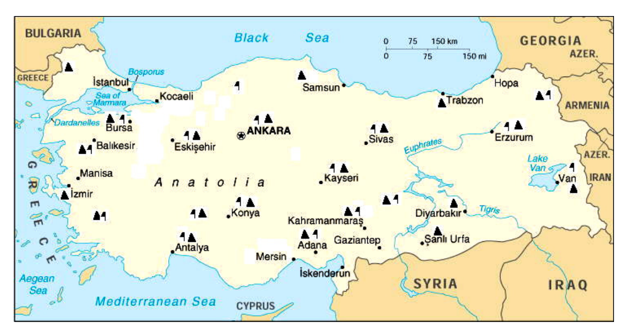
Figure 1. Map of Turkey showing locations of SHW (flag) and WUAs (triangle)-operated irrigation schemes.

a great role on temperature changes. Therefore, the south region is under the influence of sub-tropical climate which is similar to Mediterranean climate. On the other hand, in the north region of Turkey the Black Sea climate which is always rainy in all seasons is observed (Anonymous, 2009). In general, summer is warm and dry, whereas winter is cold and rainy. The average annual precipitation, total precipitation, total runoff, and total usable potential are 643 mm, 501, 186, and 112 km<sup>3</sup>, respectively (Degirmenci et al., 2008). A variety of crops are grown in the study area, but common crops are wheat, sugar beet, corn, fruit, vegetable, cotton, tobacco, rice and olive.