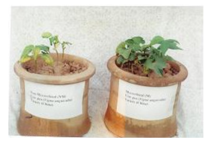
Plate 2. Effect of AM inoculation of plant height of cowpea variety (V2).

At each harvest, dry weights of roots and shoots were determined by drying samples at 70 °C for 72 h. Shoot and roots were grinded homogenously and ashing was done at 400 °C for 1 h, ash samples were analyzed for mineral including K, Ca, Mg, P, Al, Fe, S, and Si; chemical analysis were done by energy-dispersive x-ray analysis (EDXA) according the standard methods (Haq et al., 2003). Experimental data was statistically analyzed by applying the analysis of variance (ANOVA) test; the means were subjected to least significant difference (LSD) test.