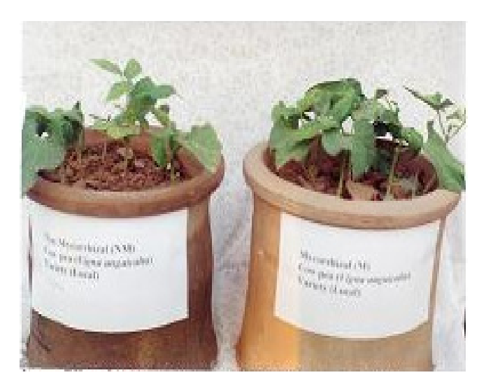
Plate 1. Effect of AM inoculation of plant height of cowpea variety (V1).

along with soil base inoculum (rhizospheric soil) were spread uniformly in layers at a depth of 3 and 6 cm before sowing. Inoculums for each pot consisted of 160 gm of mycorrhizal infected roots and adhering soil.