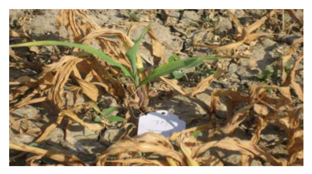
Figure 1. PPT resistance seedlings.