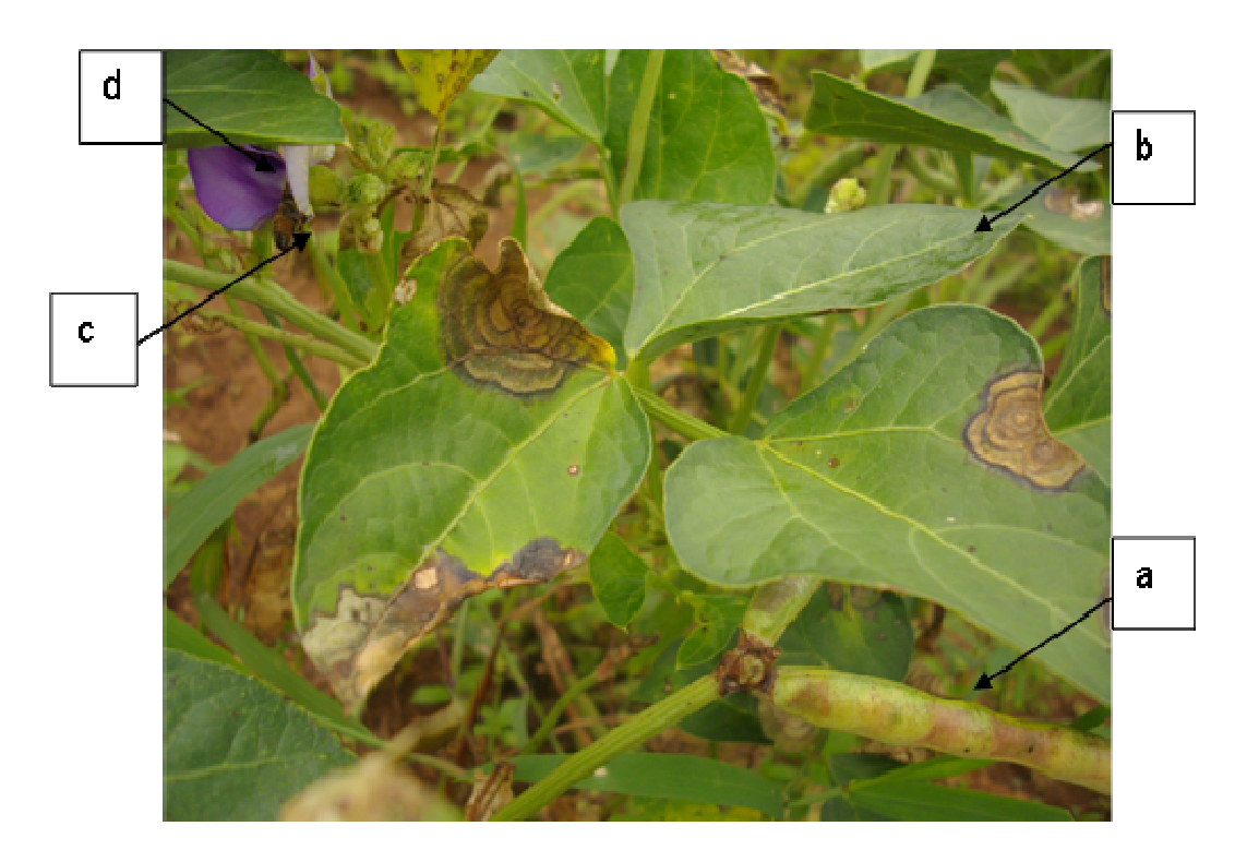
Figure 1. Part of a cowpea plant showing pods (a), leaves (b), and A. m. adansonii (c) collecting nectar in a flower (d).

The foraging speed ( V_b ) defined as the number of visits per min (Jacob-Remacle, 1989) was given by the following formula: