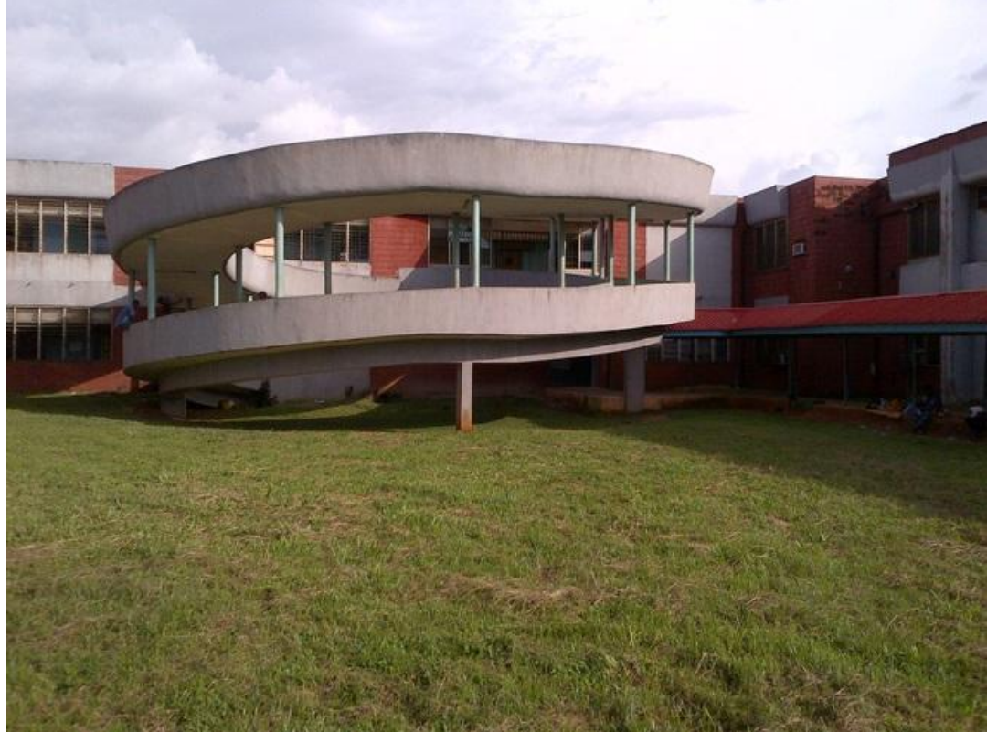
Figure 5 Ramp for conveying patients between floors of the complex.