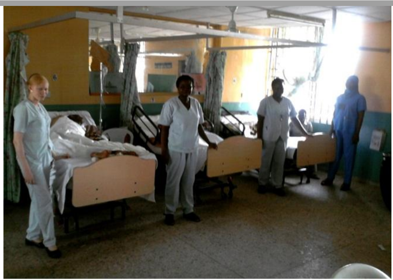
Figure 2 Trained Neurosurgical Nurses in the Neurosurgical Ward