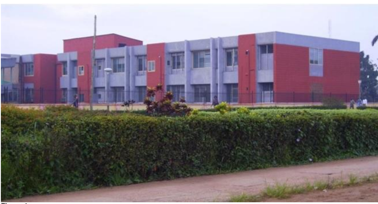
Figure 1 The Neurosurgical In-Patient Complex completed in November 2007