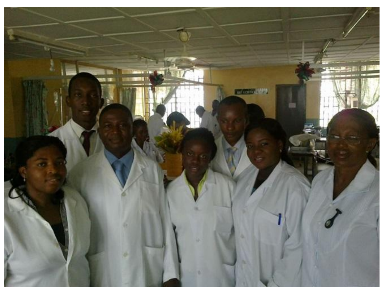
Figure 3 In-House Neuro-Physiotherapy Team