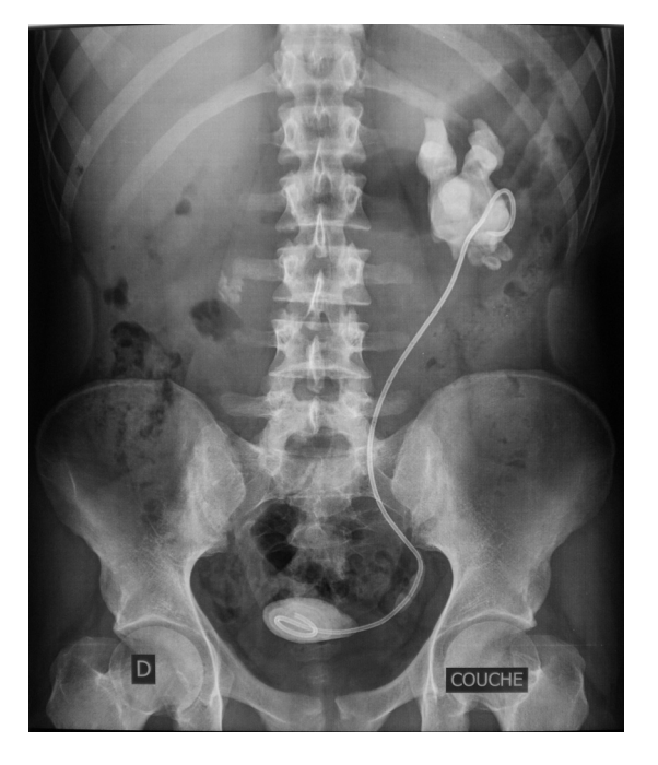
Figure 3 Plain-film radiograph showing encrusted ureteral stent with large stone burden in bladder, kidney and lower part of ureter.

in 4 patients (Fig. 4). Examination of the broken stents showed that breaks had occurred at points where the encrustation had made the stent very brittle. All the removed encrusted stents were made of silicone. Sixteen patients (72.7%) were rendered stone-free and 5 (22.7%) had clinically insignificant residual stones (3 mm or less). The mean hospital stay was 3.8 days (range 1–9 days).