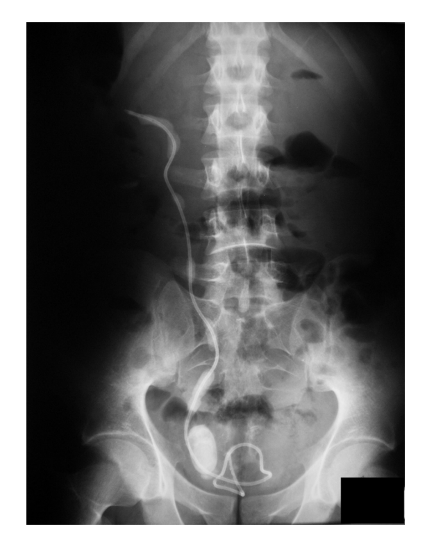
Figure 2 Plain-film radiograph showing encrusted ureteral stent with large stone burden in bladder, kidney and ureter.