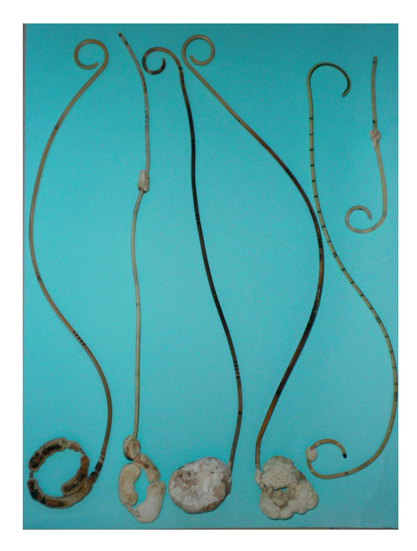
Figure 4 Examples of removed ureteral stents.

in 4 patients (Fig. 4). Examination of the broken stents showed that breaks had occurred at points where the encrustation had made the stent very brittle. All the removed encrusted stents were made of silicone. Sixteen patients (72.7%) were rendered stone-free and 5 (22.7%) had clinically insignificant residual stones (3 mm or less). The mean hospital stay was 3.8 days (range 1–9 days).