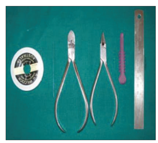
Figure 1: Explains fabrication armemtarium