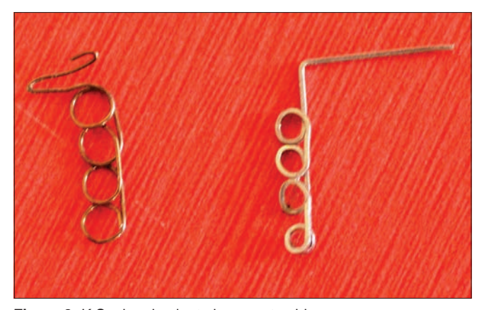
Figure 2: K.S.micro-implant placement guide

The technique mentioned in the present article is simple and accurate because the implant is inserted through the helix of the guide, hence less chance for it to be misplaced. The existing