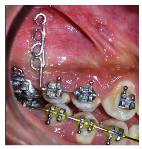
Figure 4: Clinical applications

orthodontic appliance is not disturbed and the implant guide can be disengaged without any difficulty.