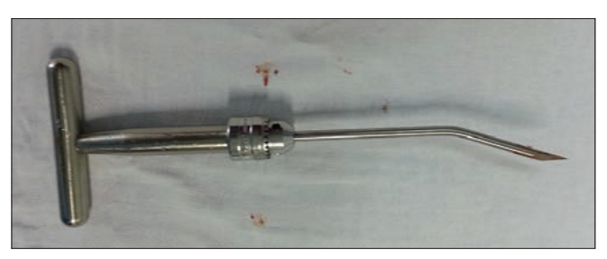
Figure 1: Curved trocar of vacuum suction set