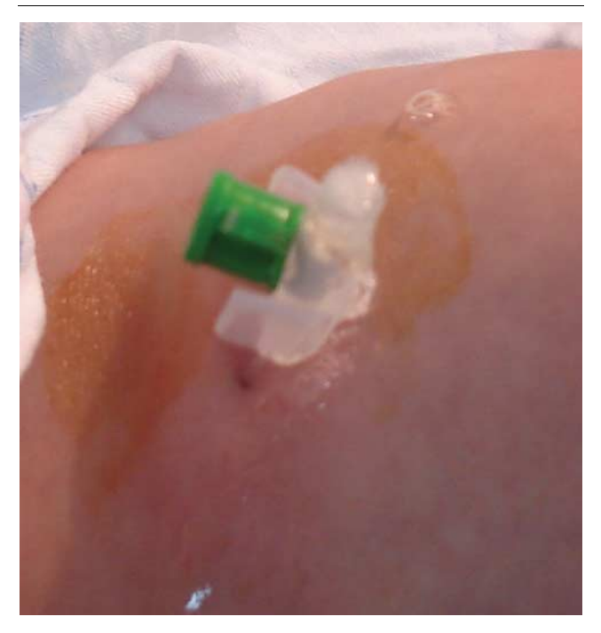
Air and clear serous fluid coming out spontaneously through the cannula.