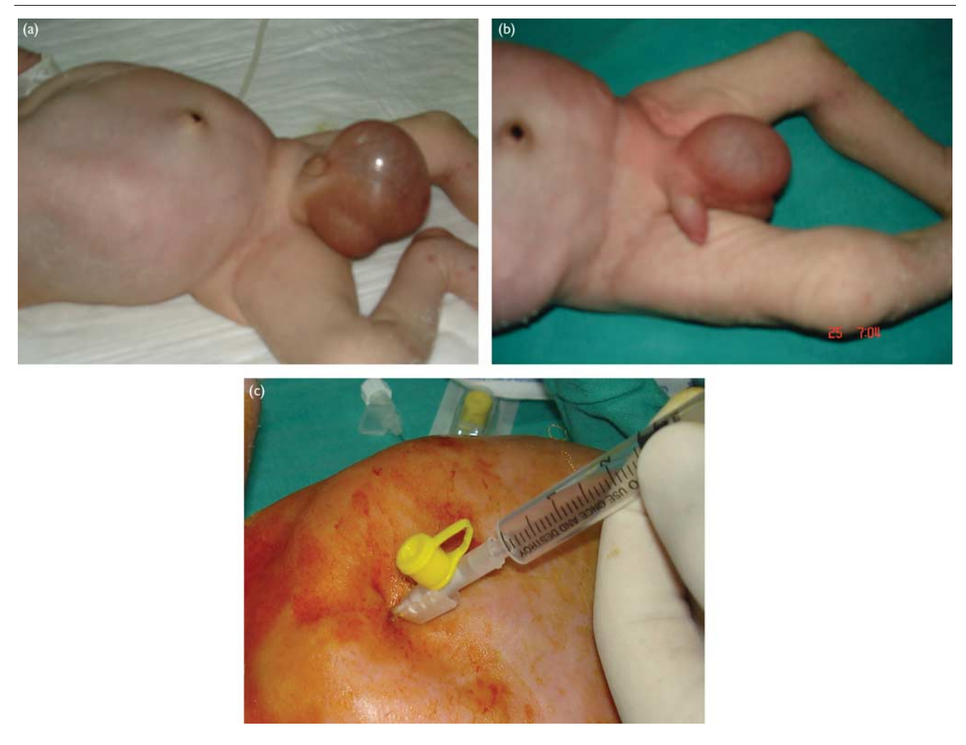
(a) A patient with pneumoperitoneum, pneumoscrotum, and surgical emphysema of the abdominal wall. (b) Pneumoperitoneum reduced to the peritoneal cavity before tapping. (c) Tapping.

completely to the abdomen and reappeared by compression of the abdominal wall. Two patients had surgical emphysema of the abdominal wall, which was spontaneous in one patient and occurred during reduction of the pneumoscrotum back to the abdomen in the other. We suggest that its occurrence resulted from the rupture of the processus vaginalis, with the escape of air subcutaneously.