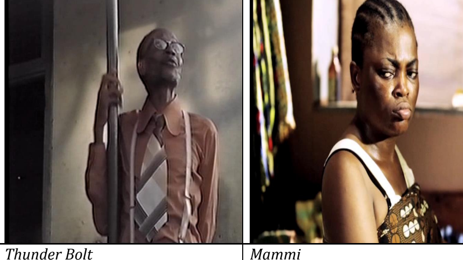
Plate 2: The presence of a Jester in Kelani's Films

However, the concept of a village jester is always employed by Kelani to create a convivial atmosphere in his films. This jester character stems its roots from Yoruba culture. The VP character in Thunder Bolt , Mammi in Mammi buttress this fact. Plate 2 explains this.