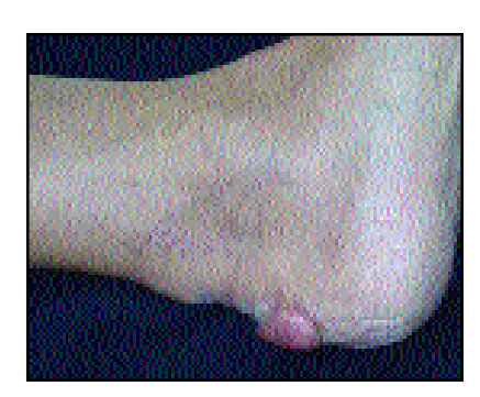
Fig. 3. Achilles xanthomata. This patient has the unusual combination of a tuberous xanthoma at the ankle and a xanthoma in the Achilles tendon.

mixed hyperlipidaemia. Fig. 3 shows a tuberous xanthoma at the ankle. Tuberous xanthomata are most commonly found at the elbows.