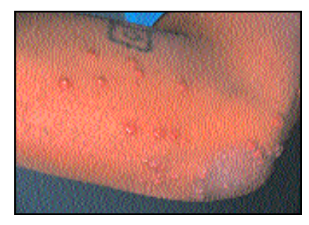
Fig. 2. Eruptive xanthomata. The patient initially presented to a dermatologist with a rash. He had newly diagnosed diabetes and his triglyceride level was 85 mmol/l. There is probably some (minor) genetic predisposition aggravated by the diabetes.