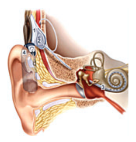
Fig. 1. Diagrammatic representation of internal and external components. 1: Nucleus 24 Contour implant; 2: receiver/stimulator; 3: Contour electrode array; 4: ESPrit 3 G speech processor.

and the intensity level required to generate the appropriate sound sensations. The electrodes stimulate the nerve fibres via a controlled electrical current which is recognised by the brain as sound. Electrical stimulation of the auditory system is effective, because almost all sensorineural hearing loss is caused by hair cell dysfunction, while the auditory nerve itself remains responsive to stimulation and can conduct impulses carrying auditory information to the brain.<sup>2</sup>