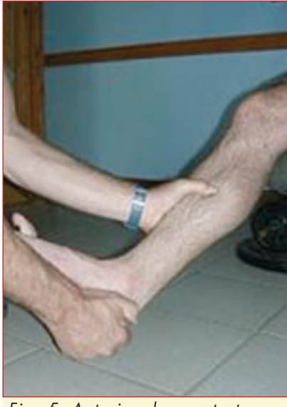
Fig. 5. Anterior drawer test.

grabs the heel, places it in neutral position and then inverts and everts the foot. The test is positive if comparison of the medial and lateral aspects demonstrates a difference of greater than 25%.<sup>46</sup>