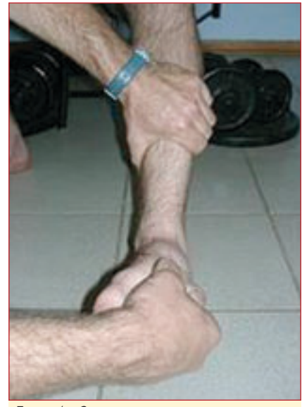
Fig. 4. Squeeze test.

Use the squeeze test to assess the syndesmotic ligaments. The examiner places one hand 15 - 20 cm below the knee on the midshaft of the lower leg. The tibia and fibula are then squeezed together. The test is positive if pain is localised in the antero-lateral region of the ankle or the distal fibula.<sup>6</sup>