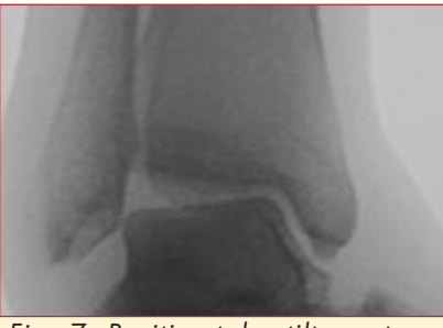
Fig. 7. Positive talar tilt on stress radiograph.

If radiographs are necessary, these should include anteroposterior (AP), lateral and mortise views.<sup>4,10</sup> Stress radiographs are generally not indicated for acute ankle sprains because findings will not change the treatment protocol.<sup>1,4</sup> However, they are of value in the assessment of chronic instability. The most commonly used criteria for abnormal laxity are those described by Karlsson:<sup>11</sup> anterior displacement of \geq 10 mm, or a side-to-side difference of > 3 mm, and for the tilt test 10° greater than the uninjured ankle (Fig. 7).