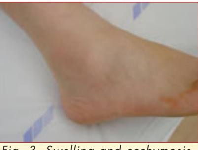
Fig. 3. Swelling and ecchymosis after ankle ligament injury.

If possible, observe the patient while s/he is standing and walking. One must inspect for swelling, ecchymosis, cyanosis, pallor, or breaks in the skin (Fig. 3). Remember the role of gravity — one can be misled into thinking that uninjured soft tissues are injured.<sup>1,2,4,5</sup>