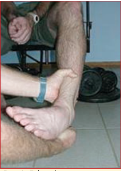
Fig. 6. Talar tilt test.

Modes of imaging that can be used include X-rays, ultrasound and magnetic resonance imaging (MRI).