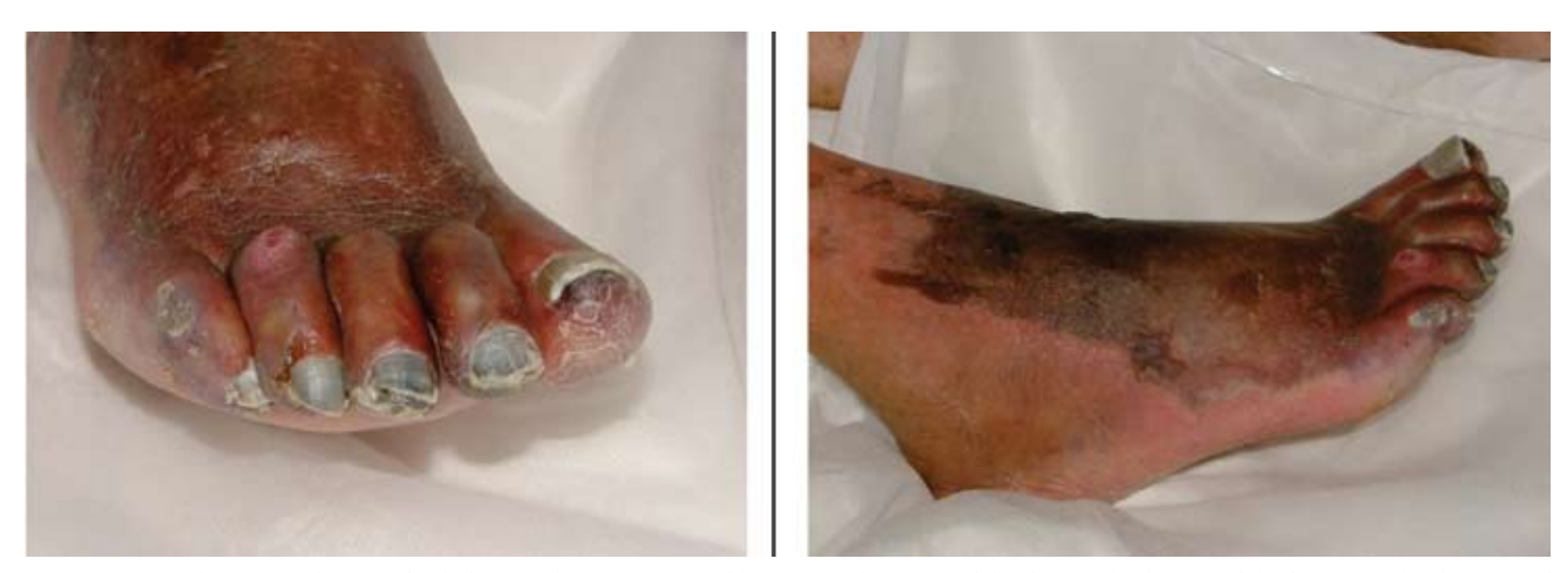
Fig. 1. Severe ischaemia in the toes of a diabetic with accompanying blistering and necrosis of the skin on the dorsum of the foot. Note the clawing and retraction of the toes with ulcer formation on the 4th and 5th toes.

Although the atherosclerotic disease process is histologically similar in both patient groups, generalised atherosclerosis is more prevalent and progresses more rapidly in diabetic patients. These patients tend to seek help for manifestations of atherosclerotic disease up to a decade earlier than non-diabetic patients do. Also, diabetic patients with coronary atherosclerosis are more likely to have silent ischaemia, with none of the typical symptoms of angina or chest pain associated with myocardial infarction. There is no evidence, however, that diabetes mellitus increases perioperative cardiac morbidity or mortality. This was proven in a multivariate study of over 6 500 major vascular procedures of all types including