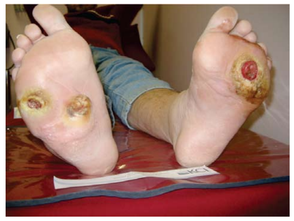
Fig. 2. Diabetic feet with all of the cardinal signs of deformity, callus formation and ulceration with infection.

Diabetic patients with compromised renal function or renal failure present a special challenge, both as far as preoperative or diagnostic angiography is concerned, and also with regard to complex interventional procedures such as remote arthrectomy, balloon angioplasty and stenting. The restriction of angiographic contrast volume is always of paramount importance in a diabetic patient undergoing any angiographic procedure, but withholding endovascular intervention when limb salvage is possible, is generally inappropriate and unnecessary. A transient rise in serum creatinine seldom leads to anuria or the need for haemodialysis. With appropriate pre- and post-intervention rehydration, plus the careful placement of interventional diagnostic catheters at the