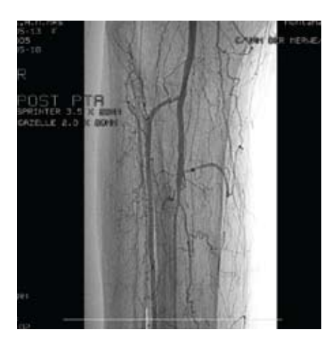
Fig. 4. After balloon angioplasty and stent the stenosis is no longer present.

The advantages of self-expanding stents in the lower limb include excellent crush resistance and extreme flexibility together with an optimal radial force.