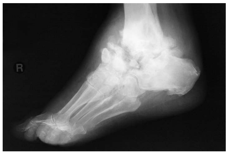
Fig. 5. Plain radiograph revealing chronic destructive effects of Charcot's osteoarthropathy in later stages. There may be no radiographic changes evident in the acute stages of the condition.