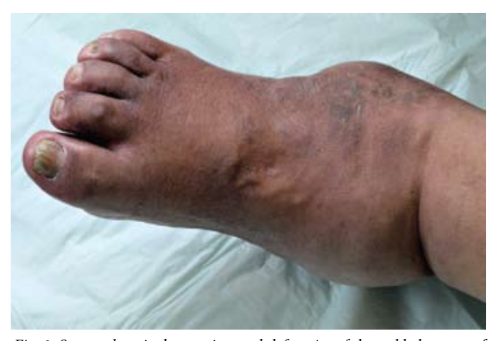
Fig. 1. Severe chronic destruction and deformity of the ankle because of unrecognised acute Charcot's osteoarthropathy.

Charcot's osteoarthropathy is a devastating, chronic, progressive destruction of bone and joint integrity affecting one or more peripheral articulations. It is characterised by joint dislocation, subluxations and pathological fractures in patients with peripheral neuropathy and results in a debilitating deformity, possibly leading to ulceration and amputation<sup>1</sup> (Fig. 1).