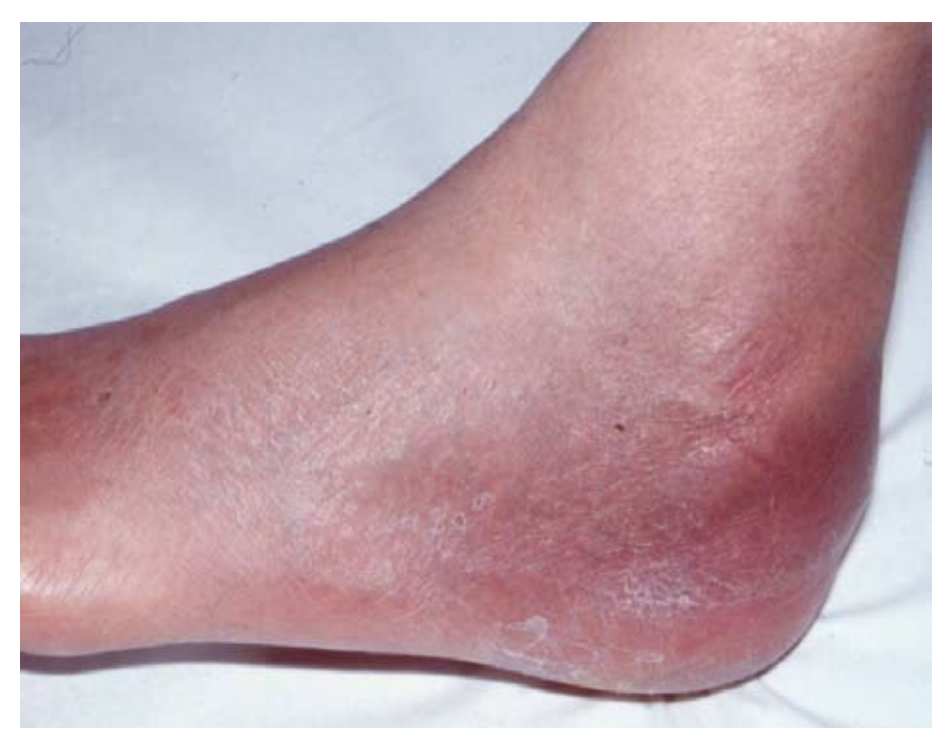
Fig. 4. Typical appearance of acute Charcot's osteoarthropathy on visual examination.

A less invasive test is available to aid in differentiating between the two diseases. Magnetic resonance imaging (MRI) provides exquisite anatomical detail of both soft tissue and bone, and may describe in more detail the nature of the bony