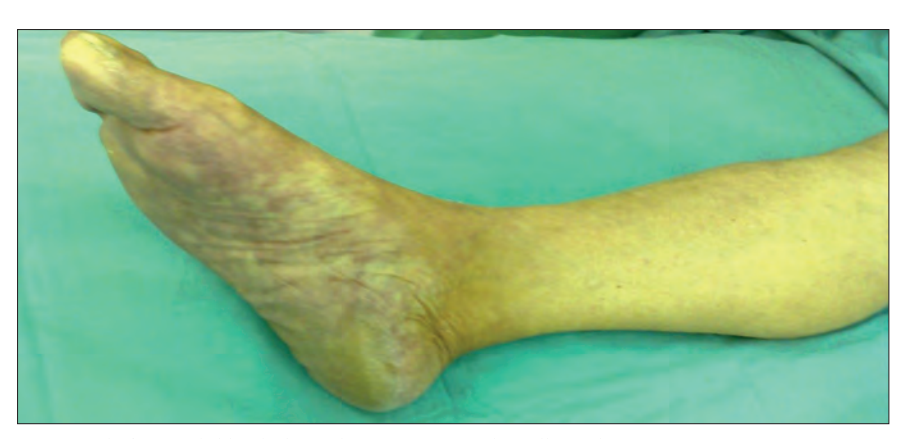
Fig. 2. Pale foot with bluish dermal staining. Note the collapsed veins.

Patients are exposed to the risk of local and remote haemorrhagic complications and proper case selection is critical (Table 4). The success of CDT is determined by the ability of the angiographic catheter to cross a thrombosed