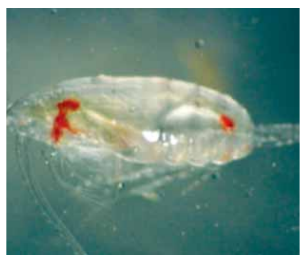
Figure 2: copepod