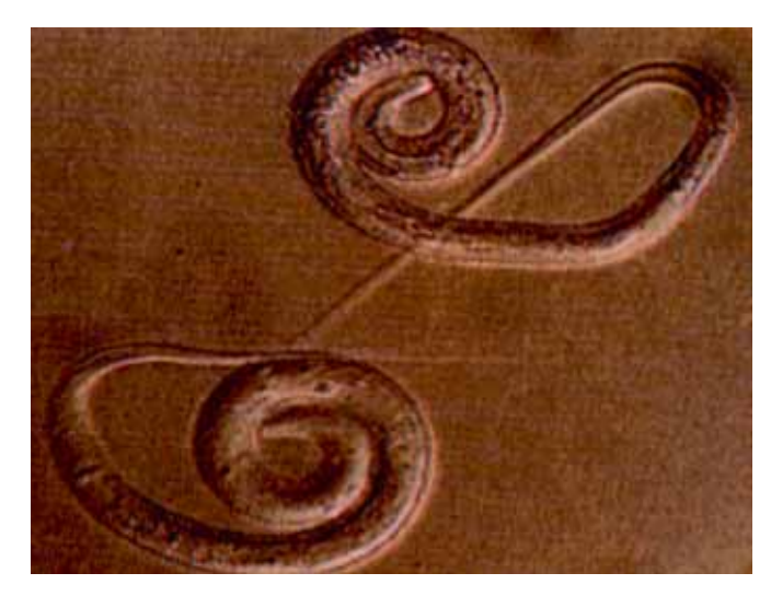
Figure 1: Male and female guinea worm, female longer than male.