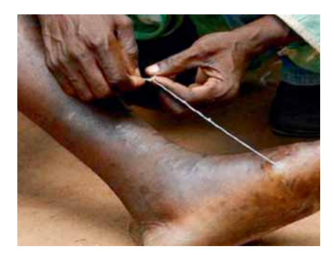
Figure 5: A worm being rolled out from a patient

The traditional technique which involves winding the worm out on a stick has been a treatment used successfully for centuries but proves to be a very painful method. An alternative method is done by surgically removing the worm. The surgical procedure is only successful if the entire worm is near the surface of the skin.