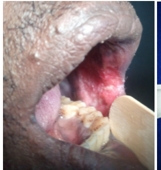
Figure 1a Clinical presentation of the buccal Fig.1b. Clinical presentation of the tongue lesion

a result of the discomfort during feeding the patient had developed significant weight loss. He had been treated over the four months using anti-fungals, antibiotics and various antiseptic mouthwashes with no response. He reported no history of chronic illnesses but was a heavy cigarette smoker and alcohol consumer for a long duration. Apart from a tender mobile left sub-mandibular lymph node the patient had no significant findings on general systemic examination. An Intra-oral examination revealed an irregularly shaped ulcer on the left buccal mucosa extending from the commissure (arrowed) and measuring about 3.5 cm in its largest diameter (Figure 1a) and on the right lateral border of the tongue measuring about 4 cm in length (Figure 1b). Both ulcers were deep, tender and surrounded by well-defined undermined margins and were covered by a yellowish membrane.