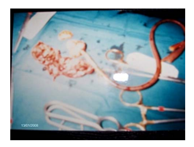
Figure 3 Supra-pubic catheter which had stayed for one year with stones forming at the tip of catheter and Prostatic adenoma removed in a 65 years old patient

Transvesical prostatectomy was done for all patients and gross anatomic appearance showed 5/64 (7.8%) isolated middle lobe, 39/64 (60.9%) isolated lateral lobe, 19/64 (29.7%) both middle and lateral lobe enlargement, and 1/64(1.6%) shows posterior commissural hyperplasia. The operative specimen weight was 73.6 +/- 32. 2 grams (range 25- 190). (Figure 2) Fifty four patients (84.3%) had detrusor muscle hypertrophy and bladder mucosal trabecula. Eight patients (12.5%) had diverticulae of the bladder wall. The mean operative time was 49.7 +/- 13.2 minutes (range 35-90 minutes). All tissue was sent for routine pathological evaluation and incidental prostate carcinoma was found in one patient who was then excluded from final data analysis. There was no death and no early complications seen in 54/64(84.4%) patients. The only intra operative complications encountered were blood loss requiring transfusion, which was needed for only 3/64(4.6%) patients. No intra/post operative cardiovascular event like arrhythmias was seen. Five patients (7.8%) had clot retention with in 24 hours of operation and all except one responded to intermittent syringe irrigation. One patient was returned to the operating room for repeat cystostomy and was found to have the urethral catheter balloon displaced out from prostatic fossa.