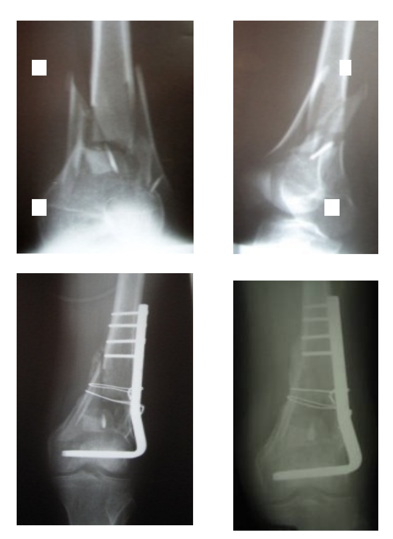
Figure 2: (a) Preoperative anteroposterior radiograph of an A3 fracture. (b) Preoperative lateral view. (c) Immediate postoperative anteroposterior view of the same fracture. (d) Radiograph taken after fracture union.

These included 2 polytrauma (one patient with fractures of the left femur, right ankle, right humerus and left radioulnar fracture; a second patient had an ipsilateral right femoral fracture, left radial fracture and patellar tendon rupture). Other injuries involved the head, upper limb fractures, acromioclavicular joint dislocation, an open tibial fracture, fractures of the contralateral femur and a hip dislocation.