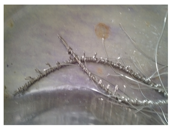
Figure 2. Improvised arch bar