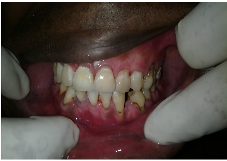
Figure 5. Appearance of the patient after healing of fracture occurred intra orally

Due to the limited resources, there was absence of arch bars, and the stainless steel wires which were present in the clinic were the 0.8mm and 0.3mm. The 'archbar' was designed so as to manage the fracture. The 0.8mm was cut into small pieces that could cover the 2<sup>nd</sup> molar from right to the 2nd molar on left side of both upper and lower jaw. 3 pieces of these 0.8mm wires were made into a bundle by tying them with the 0.3mm wire after which another 0.8mm wire was used to make hooks by rolling the wire over the bundle made previously. After each 2 turns a hook was created, until the entire bundle length was covered (Figure 2).