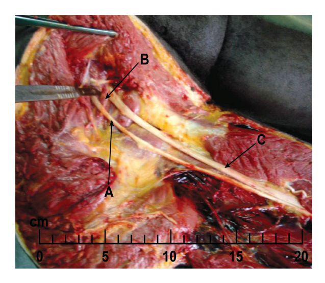
Figure 1. Common peroneal nerve (A) passing above superior gamellus (B) and Tibial nerve (C) passing below.

In one case (1.2%) the common peroneal nerve pierced the piriformis and the tibial nerve passed below it. In the gluteal region, the whole sciatic nerve was 4.2 cm, and among subjects with bifurcated nerves, the tibial and common peroneal nerves were 4.67cm and 3.3cm respectively along a perpendicular line drawn medially from the midpoint between the posterior superior iliac spine and the greater trochanter.