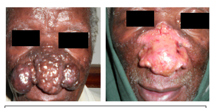
Figure 1. Pre-operative and day 5 post-operative pictures of the phymatous nose.