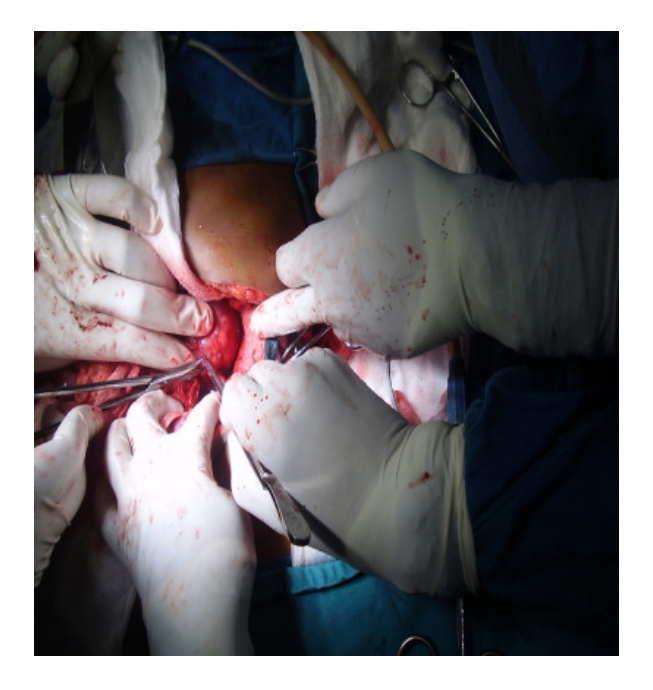
Figure 2. Adrenal vein ligated and resection continue