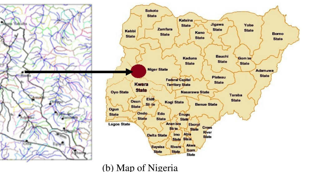
(a) Oyun River Basin Figure 1: Map of Nigeria and Oyun River Basin

Figure. River Oyun along with Asa and Weru rivers are the three main tributaries of river Awun with flows in a northwest direction for about 70km from the confluence of river Asa and Oyun and in the northeast direction for another 22km before discharging into river Niger upstream of Jebba hydroelectric dam, at an elevation of 76amsl.