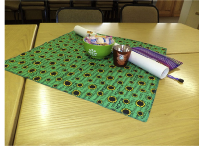
Photo 1 – World Café data collection set-up (Froneman, 2013 and Koen, Du Plessis, & Koen, 2012).