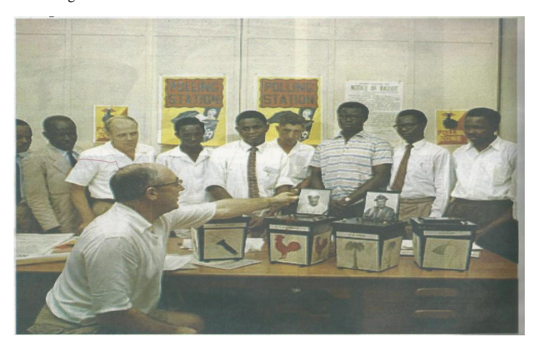
Plate 1: 1959 General Elections polling boot

Lessons from 1959 campaigns show that, the Action Group achieved promotional competitive edge over the NCNC and NPC. However, other factors added to the personalities involved ensured successes of parties at different geographical polls without an overall winner. In 1964, election design materials followed the pattern of 1959. It relied on bellow-the-line media channels as well as similar publicity effort expended earlier. However, Skywriting and Trail Sign were conspicuously absent among the campaign graphic materials. Rather major battles were fought on the pages of newspaper following carpet crossing and re-alignment of the parties. NPC aligned with Akintola's NNDP and was called Nigerian National Alliance. While the Action Group aligned with the NCNC in what was referred to as United Progressive Grand Alliance UPGA.