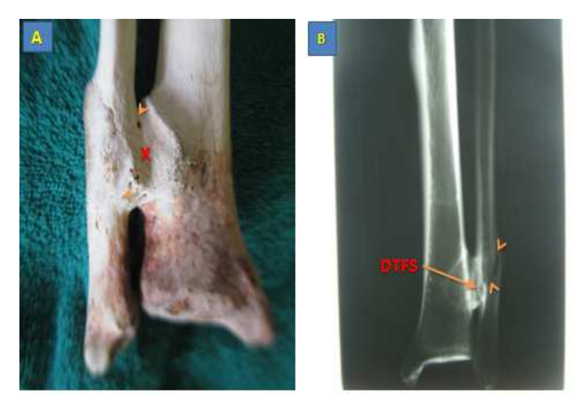
Figure 2: Photograph of the distal end of the posterior surface of the left tibia and fibula showing a shallow groove (X) and openings for anterior tibial vessels (arrowheads) in the ossified membrane (A); Radiograph of the left tibia and fibula showing oblique fracture of the distal fibula (B). (DTFS-Distal Tibiofibular synostosis).