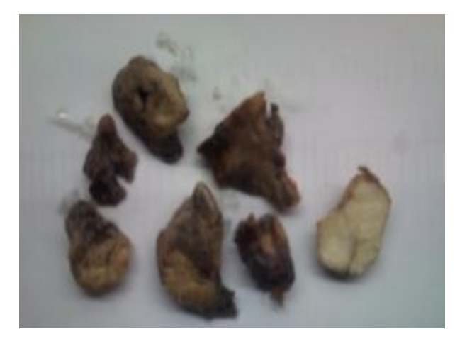
Figure 1: Gross appearance of five cystic gray brown, benign cystic teratomas and single gray white and firm, leiomyoma.

Cut section showed cysts filled with pultaceous material and hairs. There were Rokitansky protuberances. One of the nodules was fibroid measuring 3x2x1 cms. Cut section was gray white and firm with whorled areas [Figure 1]. Microscopy from all five cysts showed stratified squamous, columnar epithelium, sebaceous glands, fibrofatty tissue and cartilage [Figure 2]. Fibroid showed spindle cells arranged in interlacing bundles and fascicles. Report of bilateral and multiple benign cystic teratomas with broad ligament fibroid was given.