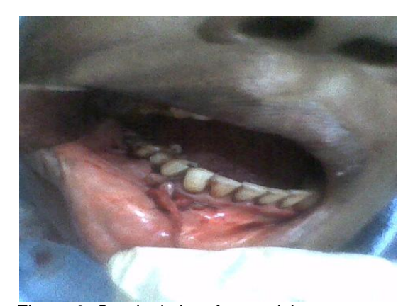
Figure 6: Surgical site after excision