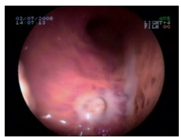
Figure 1: Sigmoidoscopic view of the lesion

on constant follow up and the rectal mass completely resolved following medical therapy.