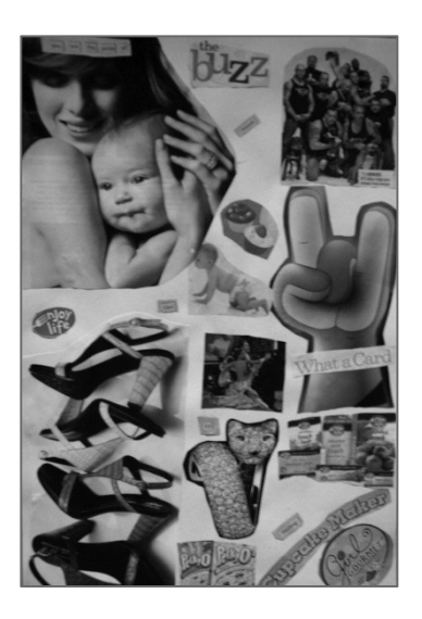
Figure 4: Dianne's Collage 2

The actual collage process for Dianne included first reading the stories again and then "finding things that reflected the stories – specific concrete pictures" (personal interview, 3.24.09). Yet in the process, Dianne began to add her own knowledge of Sarah to the stories. For example, on one collage Dianne added the word 'icy', which is not part of the original preschool stories. Her choice to include this word was based on her own experiences with Sarah, knowing