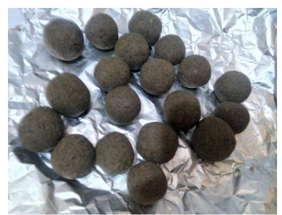
4% Moringa Soy meatball before Frying