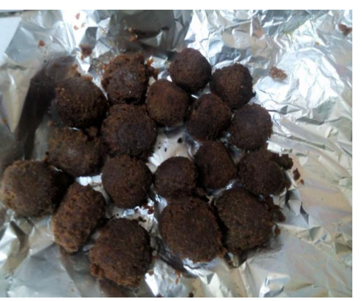
1% Moringa Soy meatballs after Frying