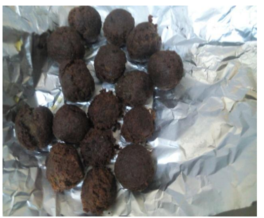
3% Moringa Soy meatballs after Frying