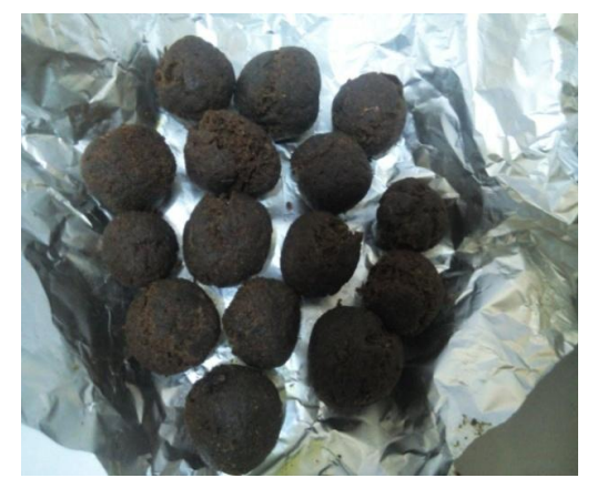
4% Moringa Soy meatballAfter Frying

PLATE 3(B): 3 – 4% Moringa Soy meatball samples before and after Frying