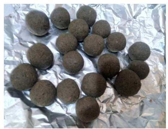
3% Moringa Soy meatballs before Frying