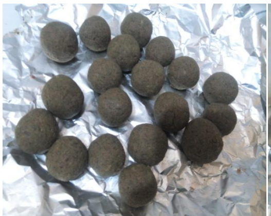
2% Moringa Soy meatballs before Frying