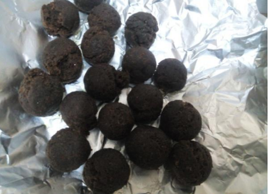
2% Moringa Soy meatballs after Frying

PLATE 3(A): 0 – 2% Moringa Soy meatball samples before and after Frying