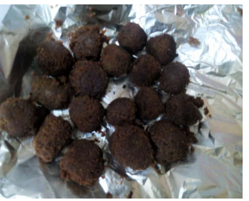
0% Moringa Soy meatballs after Frying