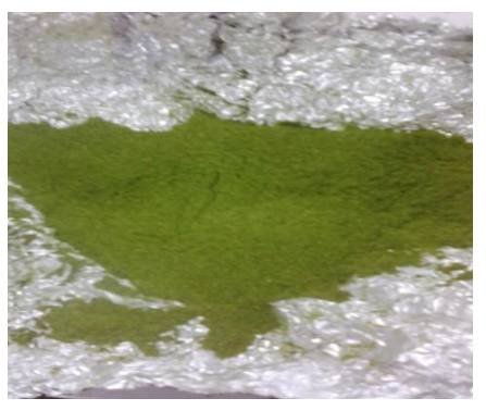
Fresh Moringa oleifera leaves