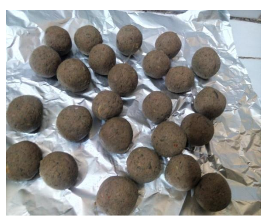
1% Moringa Soy meatballs before Frying