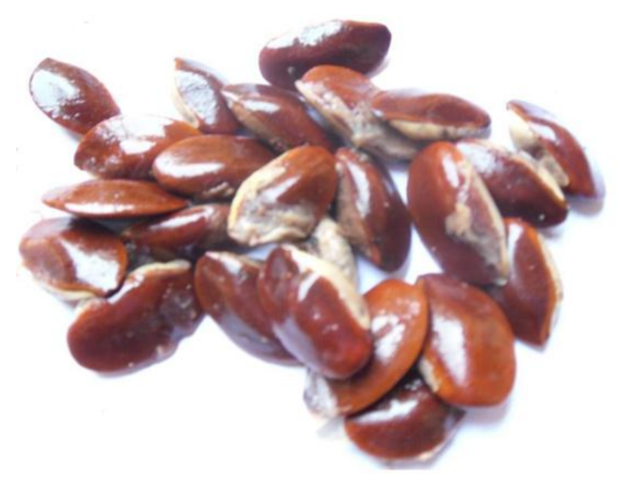
Plate 1b: Seeds of Gambeya albida