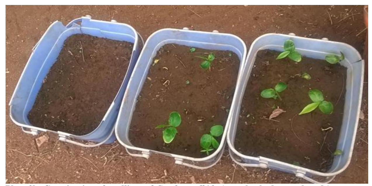
Plate 3b: Germinating of seedlings of Gambeya albida (completely decoated seeds)