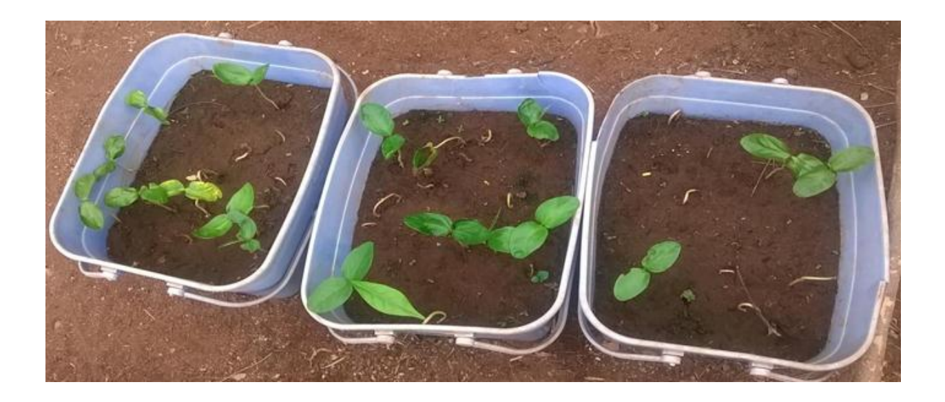
Plate 3b: Germinating seedlings of Gambeya albida (filed seeds)