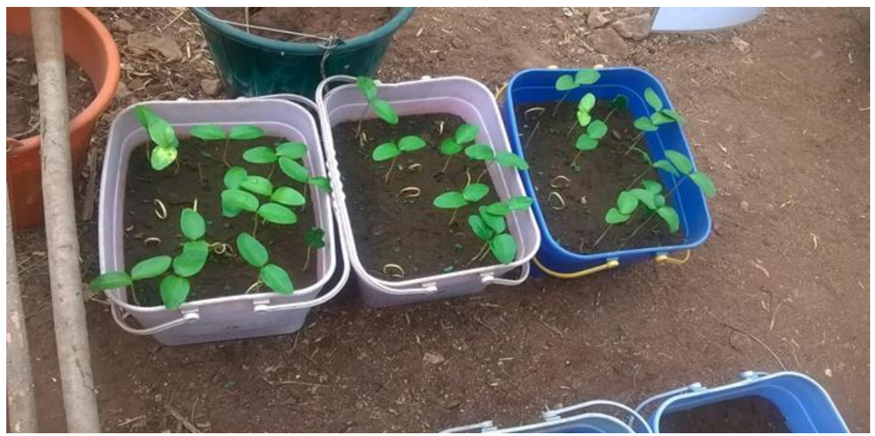
Plate 3a: Germinating seedlings of Gambeya albida (untreated seeds)